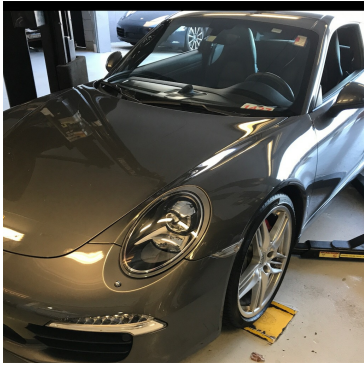
Exterior LF Corner