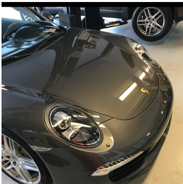
Exterior RF Corner