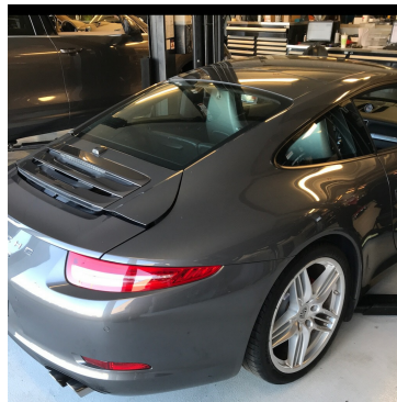
Exterior RR Corner