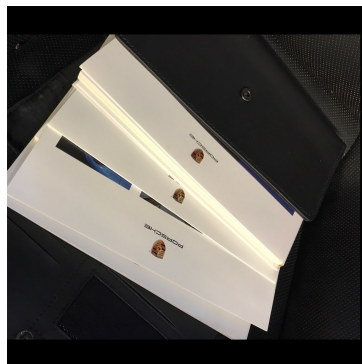
Miscellaneous (Keys/Manual,Tires, etc.)