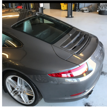
Exterior LR Corner