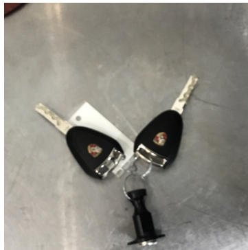
Miscellaneous (Keys/Manual,Tires, etc.)