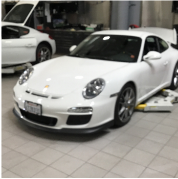
Exterior LF Corner