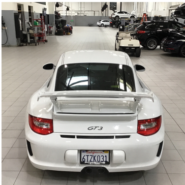
Exterior Deck Lid (or misc if not equipped)