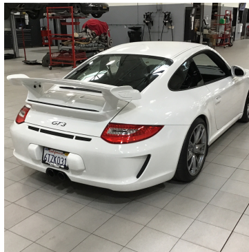
Exterior RR Corner