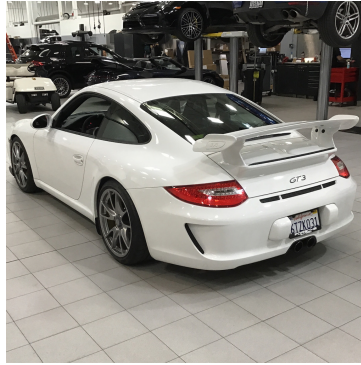
Exterior LR Corner