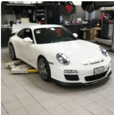
Exterior RF Corner