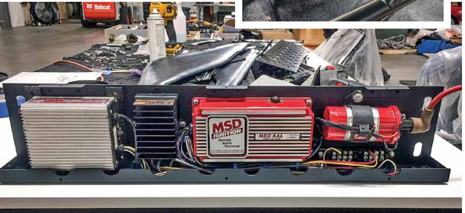
MSD electronic ignition installment.