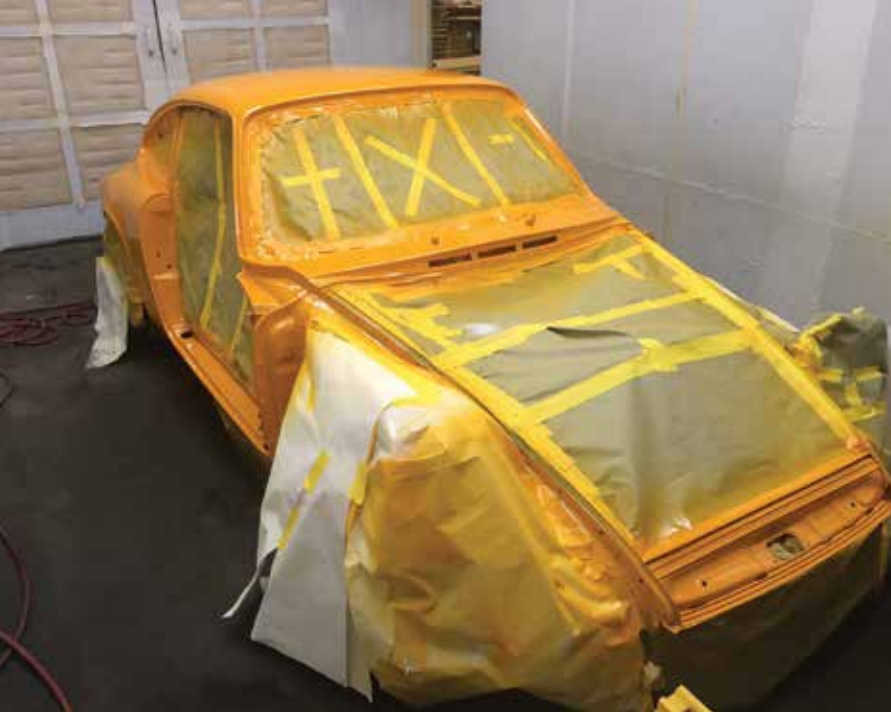
Paint, a painstaking but fulfilling stage of a restoration.