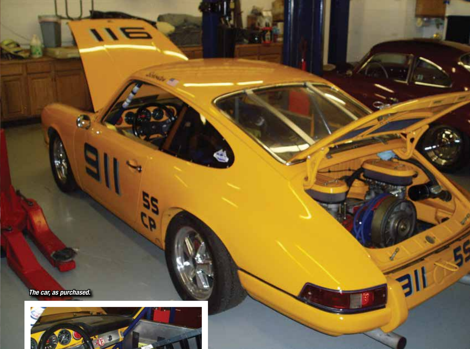
The car, as purchased.