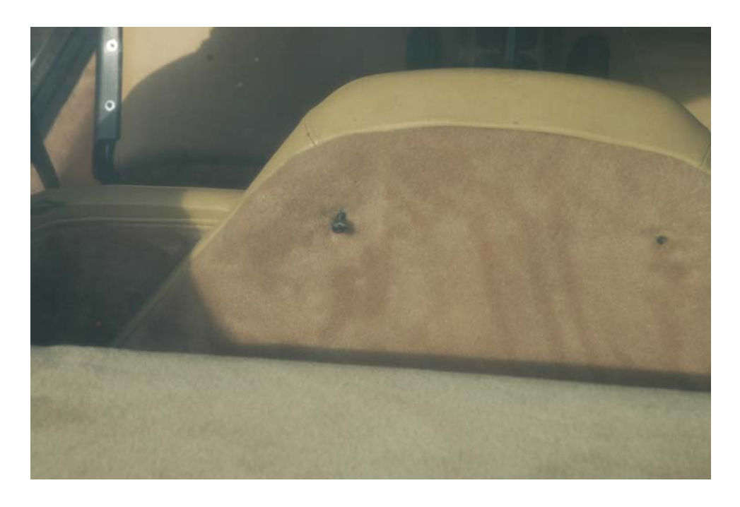
This panel is glued at the bottom so removal will meet with resistance

Remove the back rest bolts (3 per side) and take off back rests. This picture is taken with the RSD already removed for clarity.