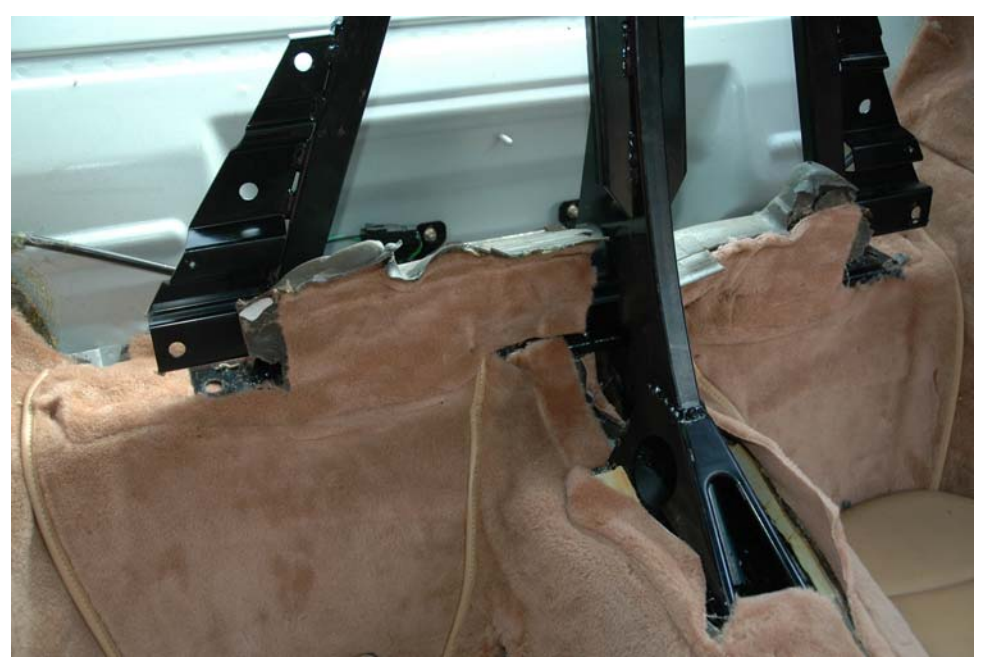
Try to preplan your carpet cuts in advance. I had not made X cuts on the front bolts, so this may have resulted in more carpet cutting than was necessary.

Once all the bolts have been removed, you will need to carefully cut the carpeting and fill padding to remove the Rear Seat frame. In the front section there is a large amount of foam that is attached to the metal frame yoke. Separate this foam from the frame carefully, then remove the frame.