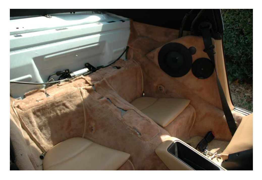
All of this area will be / is covered by the RSD deck, so I have not replaced the carpet – yet. You can buy replacement OEM carpeting by the yard from World Upholstery.