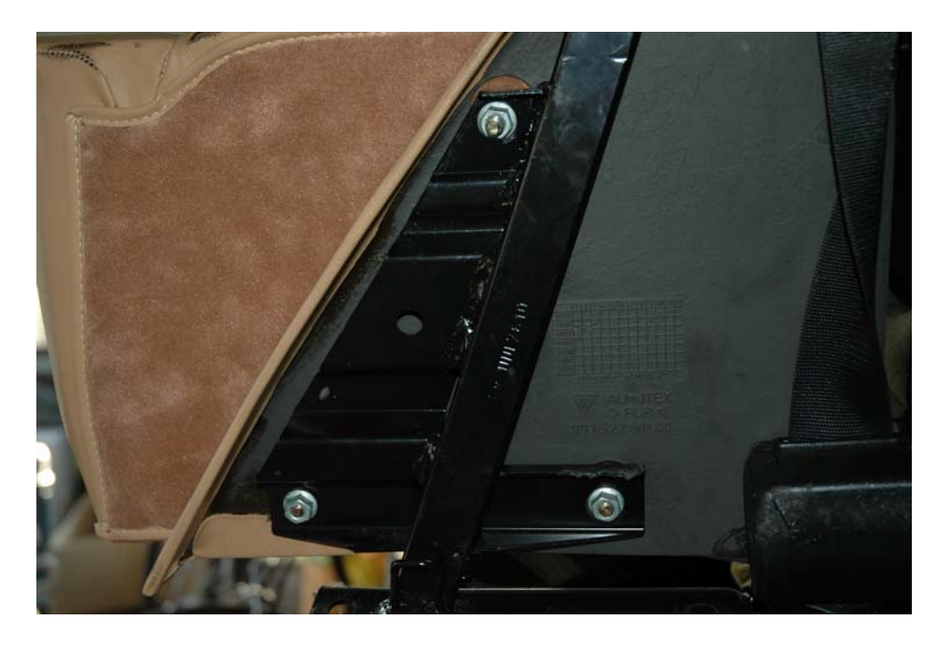
Once the back rests have been removed, remove the small bolt on the backside at the very top of the Rear Seat frame.

Remove the back rest bolts (3 per side) and take off back rests. This picture is taken with the RSD already removed for clarity.