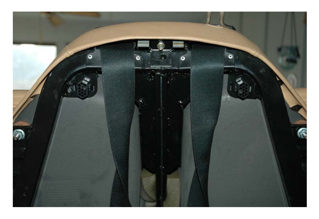
Remove the plastic covers and screws on the very front of the seat assembly