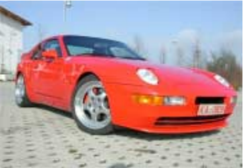
964 RS 3.8 with Speedline for Porsche wheels (left) and a 968 Turbo S also with Speedline for Porsche wheels (right).