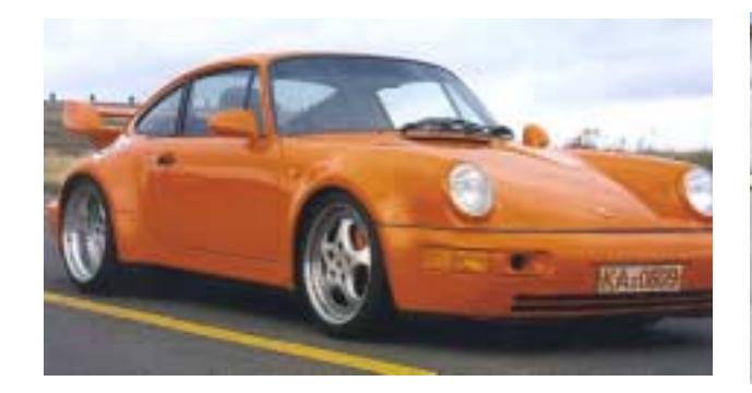
Caution The 18 Inch Speedline for Porsche wheels must not be dismantled, as they cannot be reassembled with standard shop equipment.