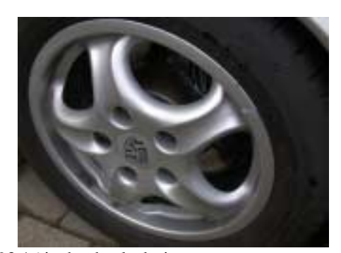
Design 93 16 inch wheels (left )and 1996-98 model year (right) 993 16 inch wheels design