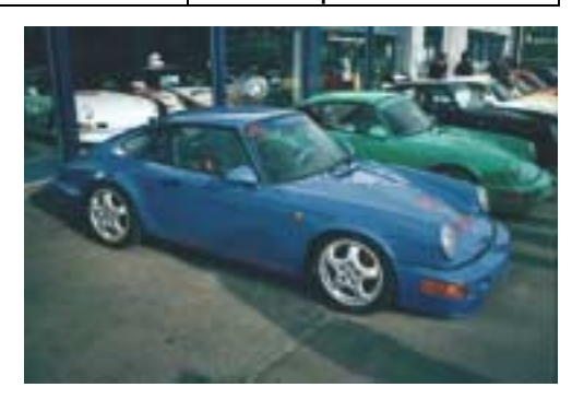
Design 92 wheels on a C4 (left) and 964 RS (right)