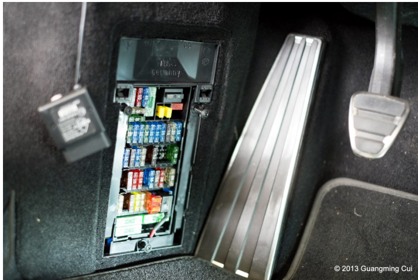
View of the fuse box area (981, others similar)