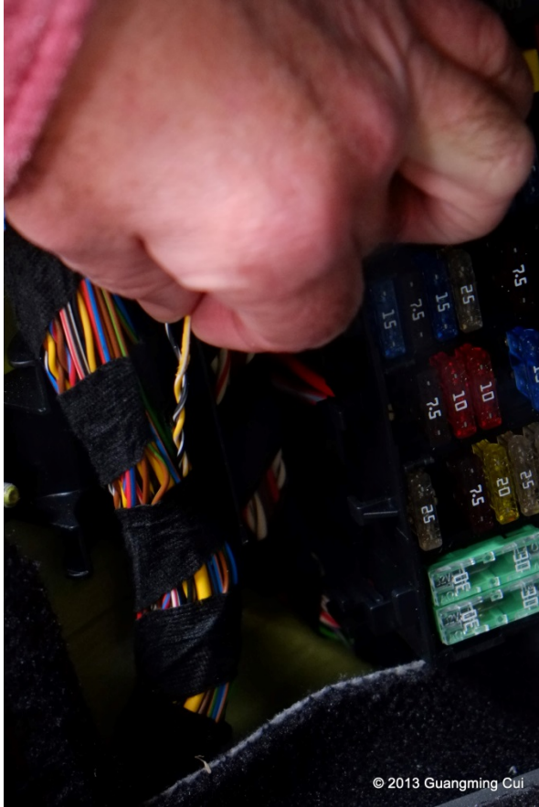
Extraction of twisted pair. Yellow/white strip CAN+, Black/white stripe CAN-