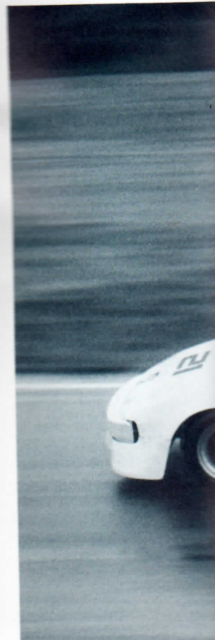
Porsche swept the first five pl