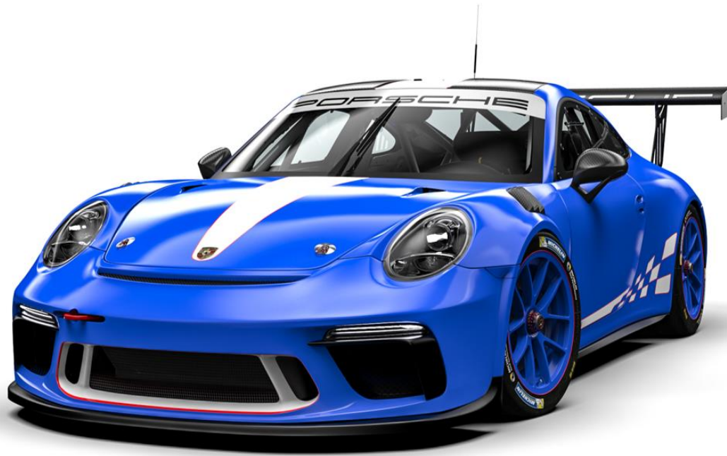
911 GT3 Cup PCA Edition