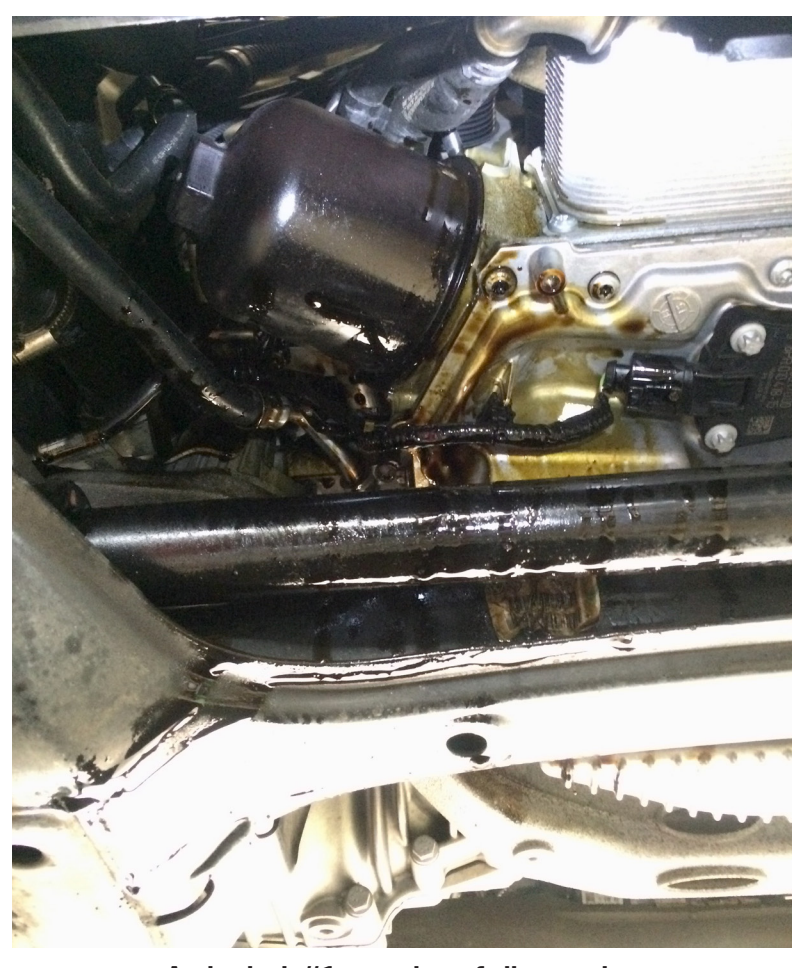
Active leak #1 overview of oil on engine