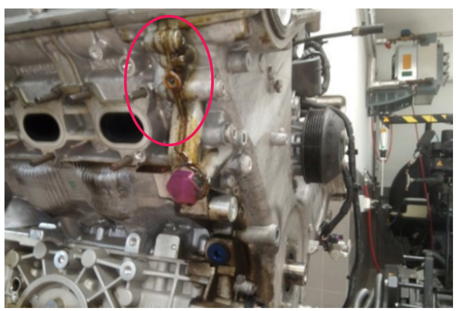
A picture of the location and source of oil leak with engine clearly removed is required