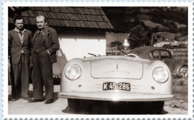
Erwin Komenda and Ferdinand Porsche with the 1948 Porsche "H1". At right the first Porsche Sales Brochure, produced in 1948.