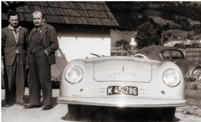
Erwin Komenda and Ferdinand Porsche with the 1948 Porsche "H1". At right the first Porsche Sales Brochure, produced in 1948.