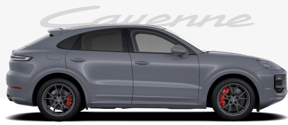
Cayenne S Coupe