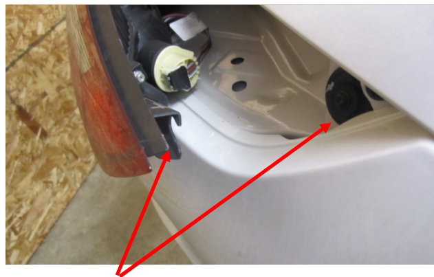
Make note of assembly for installation