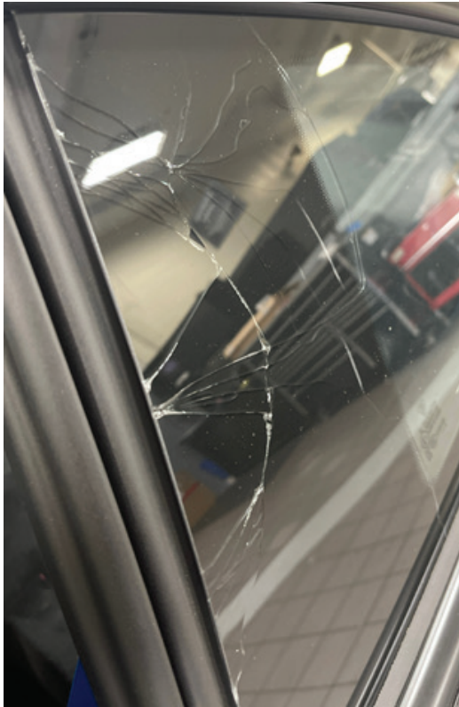
Figure 2 - Rear quarter glass (side window pane): cracks near front edge

There are two main causes for this condition: