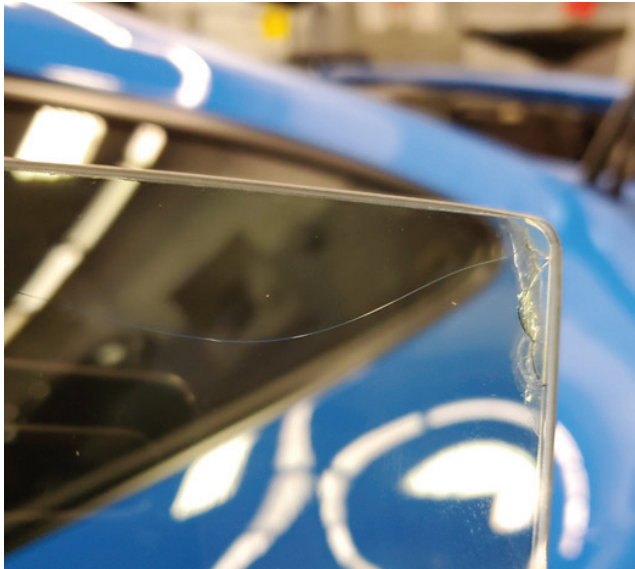
Figure 1 - Driver's door glass: cracks in the top corner

There are two main causes for this condition: