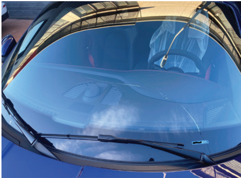
Figure 4 - Front windshield: various cracks

Stress cracks in the front windshield are currently being analyzed by Porsche. The root causes for the different kinds of stress cracks are unknown at the time of publication of this document.