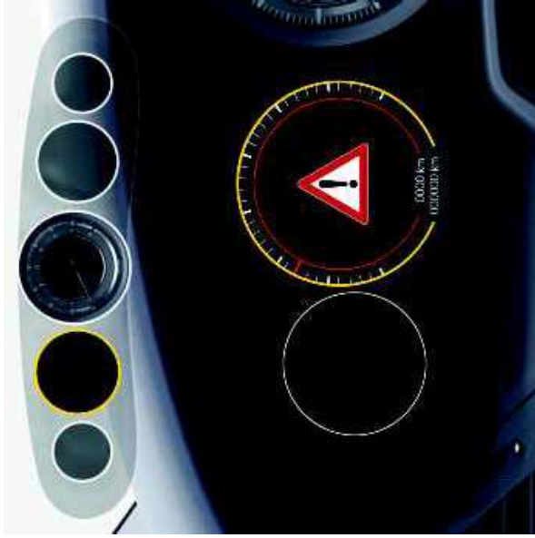
Fig. 142: Collision warning on the instrument cluster The collision warning warns the driver by means of a warning tone and a symbol on the instrument cluster.