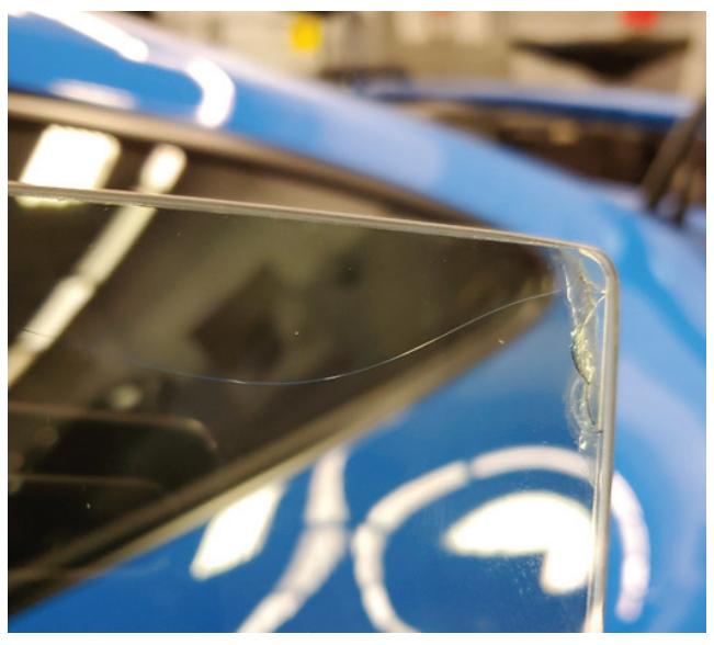
Figure 1 - Driver's door glass: cracks in the top corner

There are two main causes for this condition: