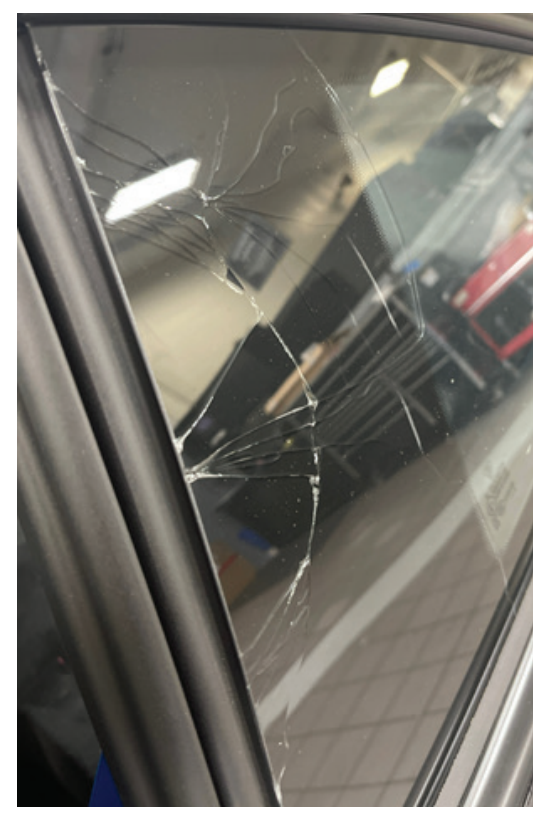
Figure 2 - Rear quarter glass (side window pane): cracks near front edge

There are two main causes for this condition: