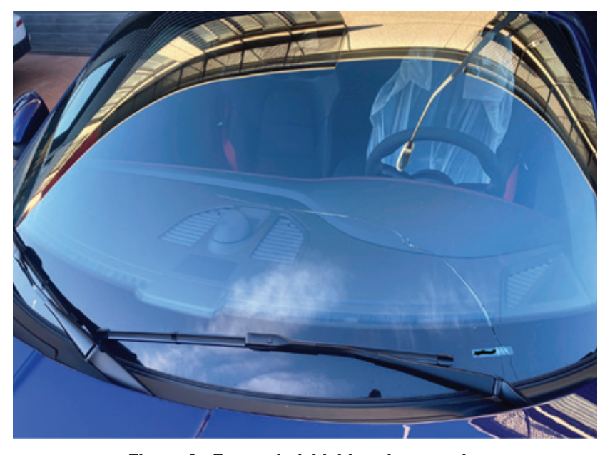
Figure 4 - Front windshield: various cracks

Stress cracks in the front windshield are currently being analyzed by Porsche. The root causes for the different kinds of stress cracks are unknown at the time of publication of this document.