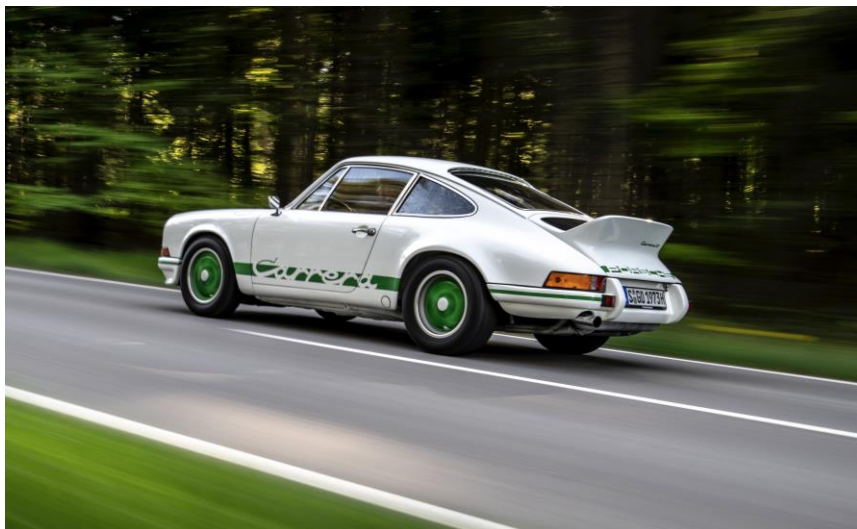
911 Carrera RS 2.7