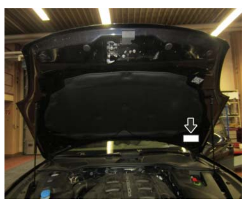
Proof of Completion Label: specified position (Exemplary illustration — 911 (991) position accordingly)

For warranty processing, see the section \Rightarrow Technical Information '9X00IN Warranty processing' .