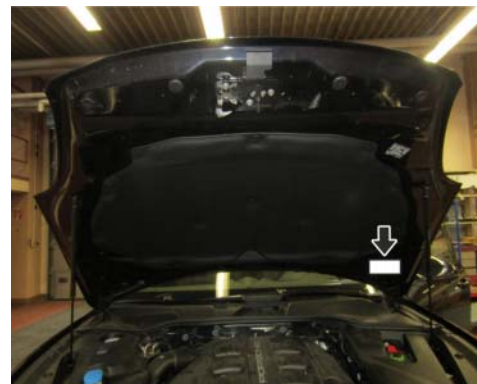
Proof of Completion Label: specified position (Exemplary illustration — 911 (991) position accordingly)

For warranty processing, see the section ⇒ Technical Information '9X00IN Warranty processing' .