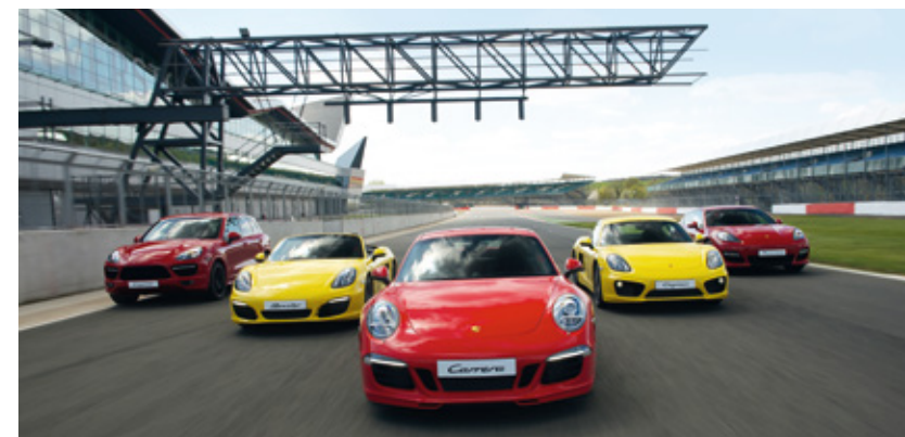
Porsche models (excl. Panamera S E-Hybrid): fuel consumption (in l/100 km) urban 18.9–6.7 · extra urban 8.9–5.6 · combined 12.4–6.1; CO 2 emissions 289–159 g/km

hundredth of a second counts. As does every muscle fibre. We call this Human Performance. At the Porsche Experience Centre Silverstone, you will learn about the most important aspects of motor sports training and nutrition. After an exciting day of driving, you will board an exclusive charter flight to Leipzig for a dinner in a specially chosen gourmet restaurant.