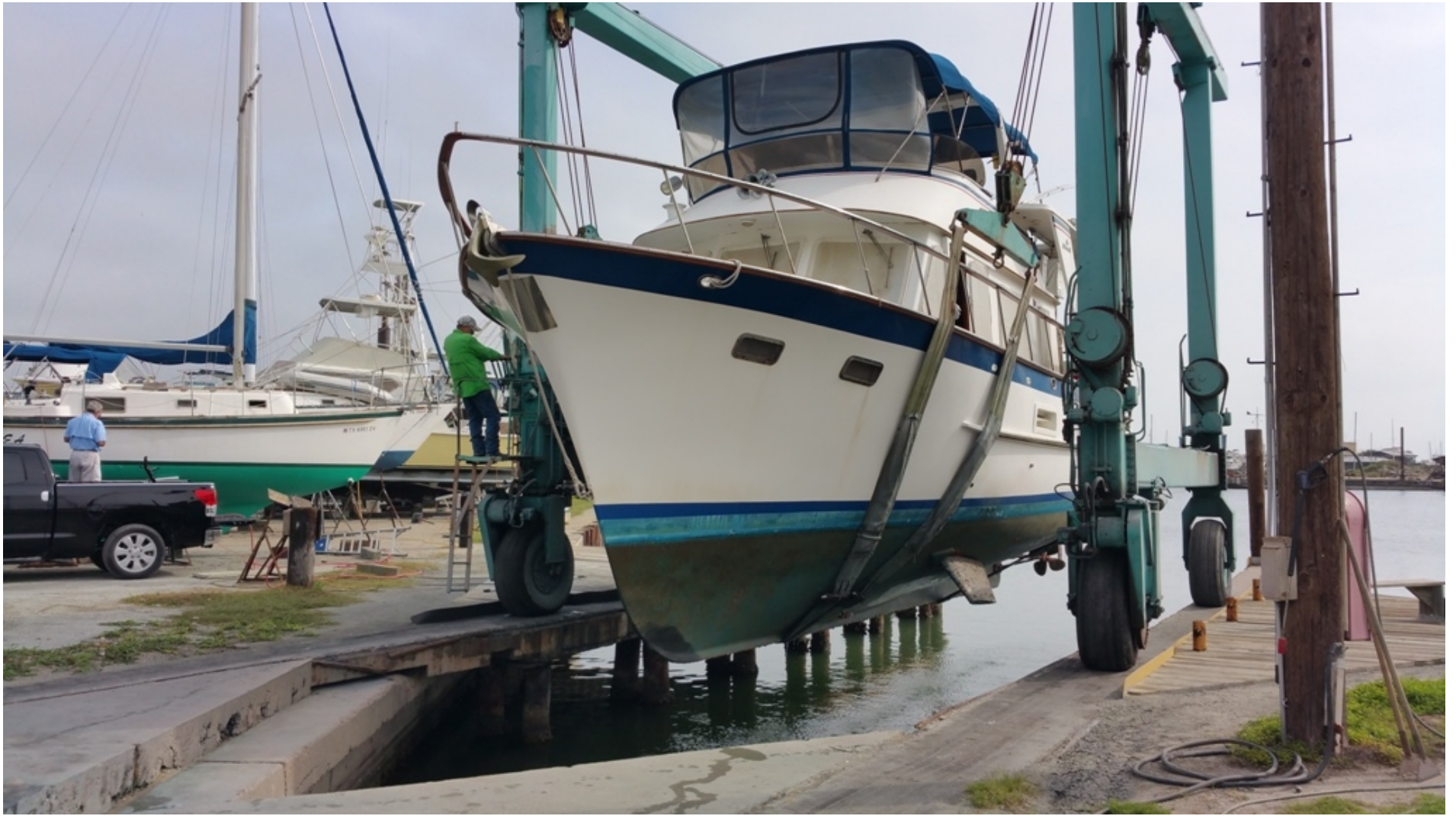
Getting the boat out of the water for a new bottom paint job and other maintenance work