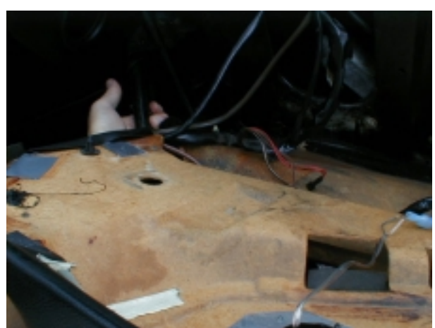
8. The panel is held in by about 9 white clips, spread along the bottom, top, rear, and front edges of the panel (note: those photos taken after panel was removed).