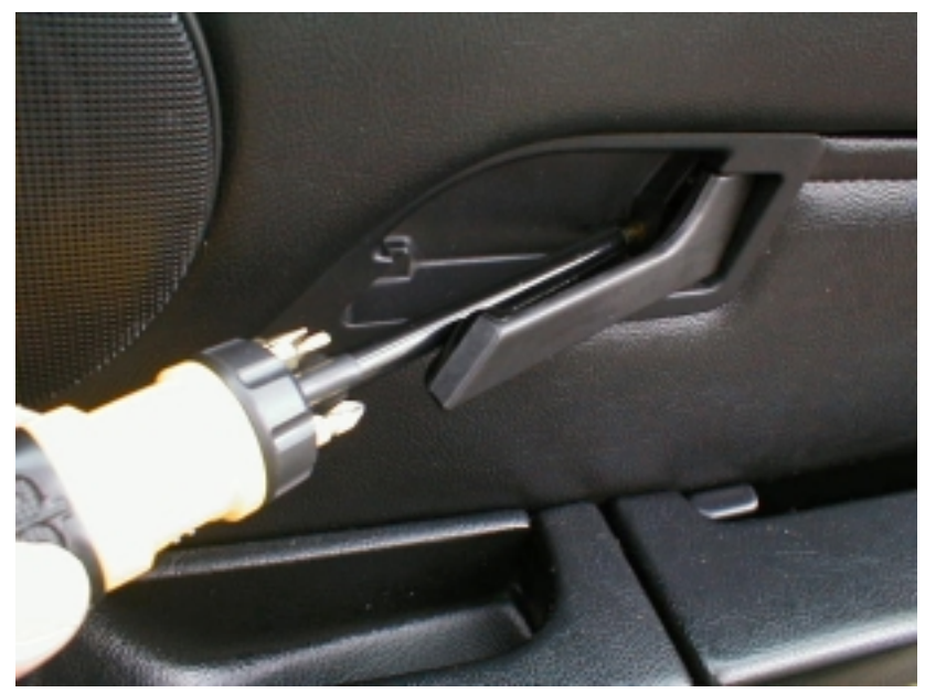
2. Pull the door handle to reveal a <u>screw</u> behind it that holds in the door-handle backing. Remove this screw, and <u>pull the backing off</u> over the door handle.