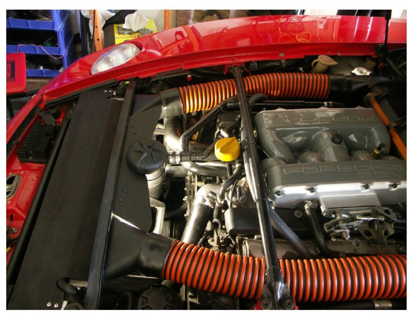
Overhead view of optional Provent cover plate with optional LED light kit and lights on during day light hours