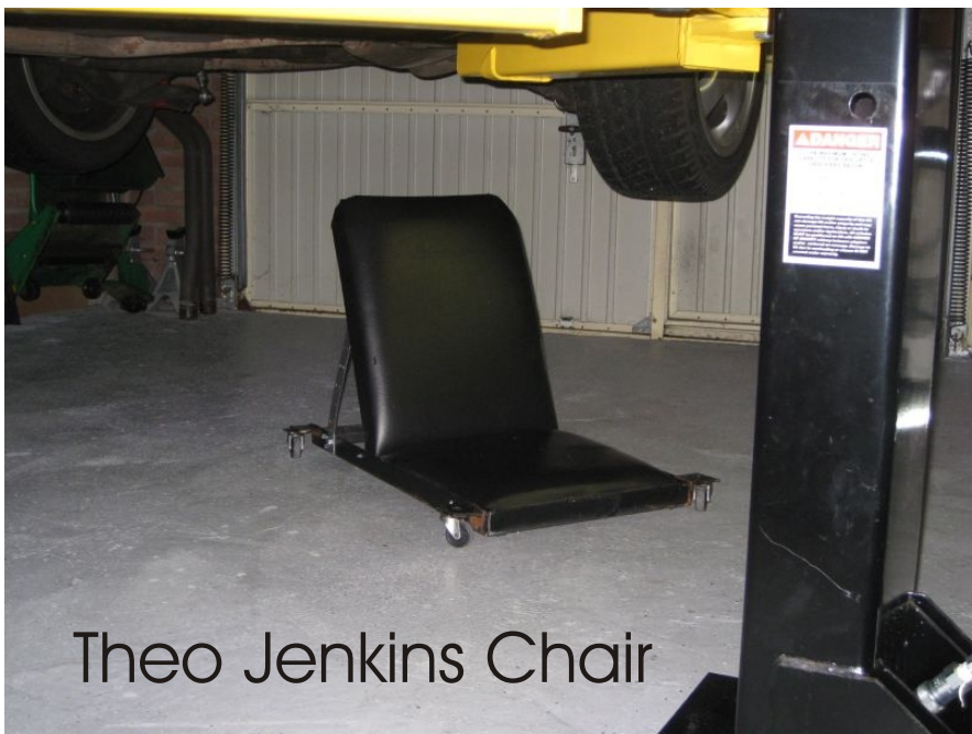
Theo Jenkins Chair

Future plans are; A; Tool box/trey B; Seat with adjustable height & back & head rest C; Box for rags, lubes, cleaners etc.