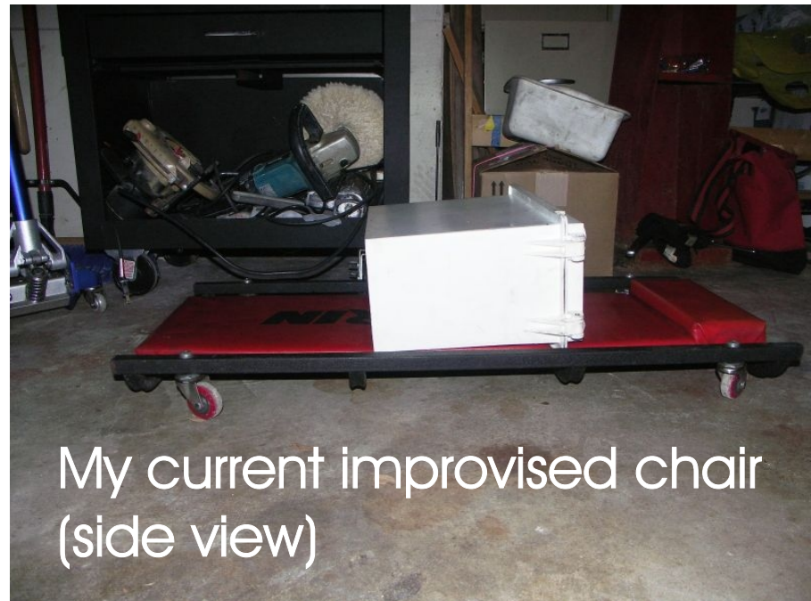
My current improvised chair (side view)