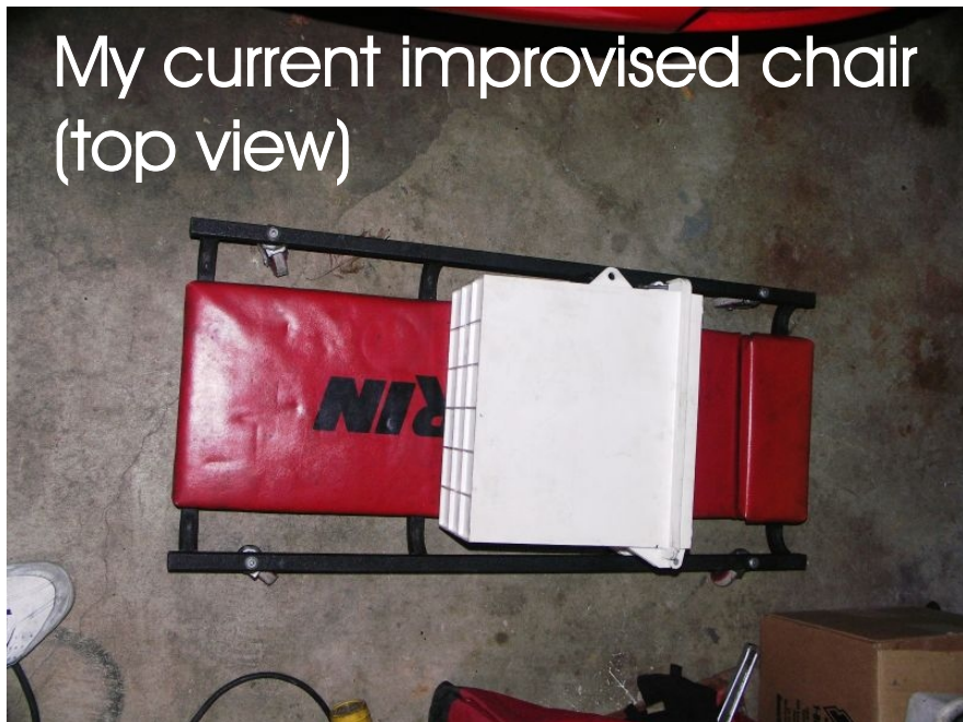
My current improvised chair (top view)