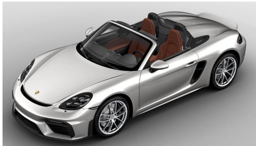
*Shown in GT Silver Metallic