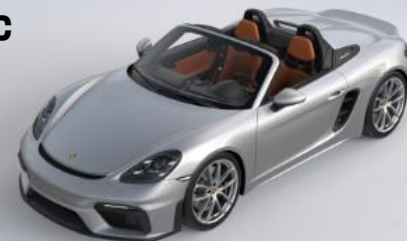
GT Silver Metallic

GT silver was first released on the Carrera GT in 2003, another mid engine roadster with dual nacelles and long sculpted side intakes. The color combination of GT Silver and Ascot Brown on the original Carrera GT was the inspiration behind the 000 CXX package.